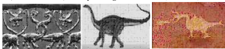
The Cataclysm (Gen. 7:11-8:14)

Virtually all peoples have legends of a catastrophic flood Human bones and artifacts found inside coal Human/dinosaur footprints found in the same strata Drawings indicate contemporaneous existence. Wupatki NP Petroglyph Dinosaur/Mammoth Sauropod, Behemoth-brachiosaurus Job 40:15-24; Leviathan-kronosaurus Job 41, Ps 104:25-26; tanniyn-dragon-dinosaur (28 times)